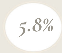
Divorce Rate for Witness to Love Couples 5-Year Mark

Traditional marriage preparation is not significantly impacting the divorce rate.