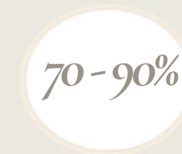
Increase in Church attendance among Witness to Love newlyweds.