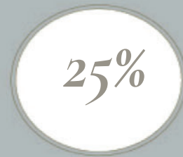
Divorce Rate for General Population 5-Year Mark