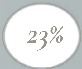
Divorce Rate for Catholic Couples 5-Year Mark